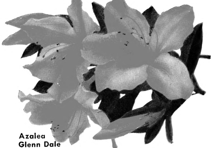
Azalea Glenn Dale "Glamour"